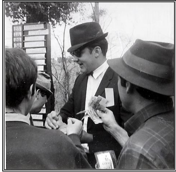
Serious money changed hands on the result of the sack race and the sheaf-tossing competition.